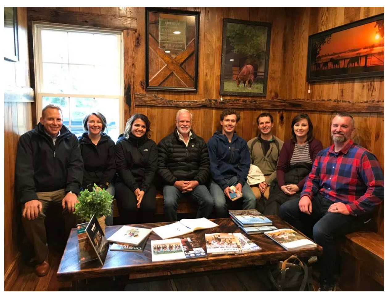
Figure 1: The Rural Learning Community Cohort, on site in Millersburg, Kentucky.

Between September 2018 and August 2019, NeighborWorks brought together five organizations to explore approaches to these challenges with the overarching goal of field building; working collectively to tease out best practices, improve outcomes and present learnings to inform efforts in the network and the field. The